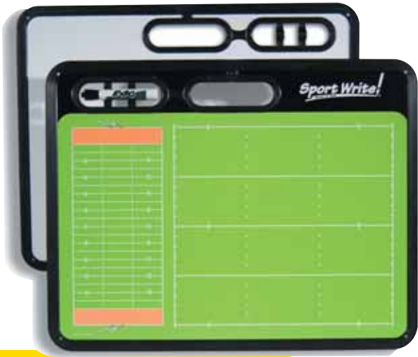
Football ■ 23" x 18" *