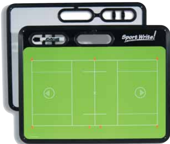
Men's Lacrosse ■ 23" x 18" *