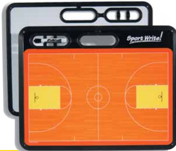
Basketball ■ 23" x 18" *