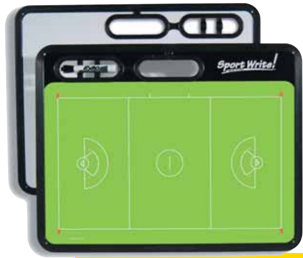
Women's Lacrosse ■ 23" x 18" *