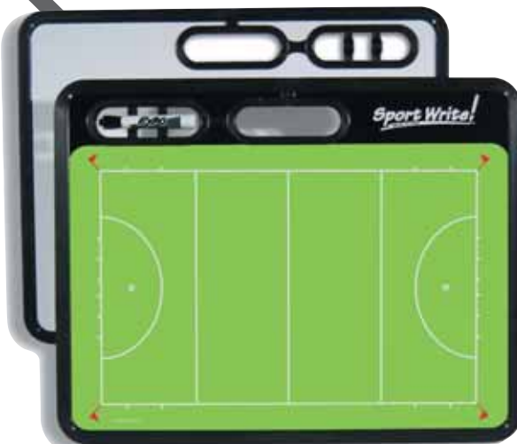
Field Hockey ■ 23" x 18" *