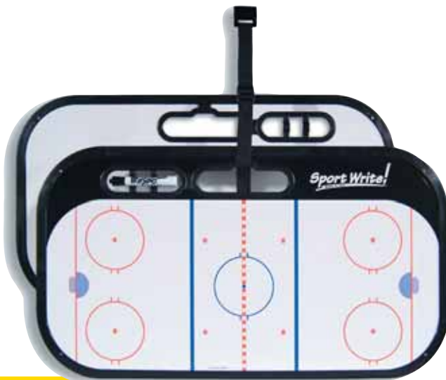
Hockey ■ 29" x 16" **