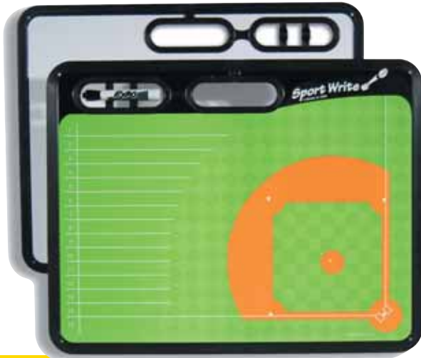
Baseball ■ 23" x 18" *