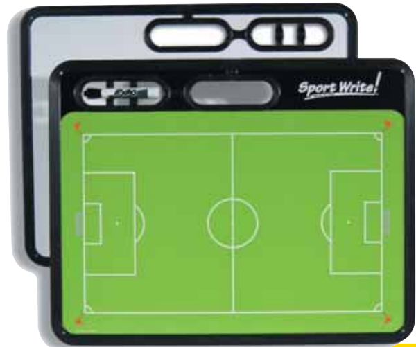
Soccer ■ 23" x 18" *